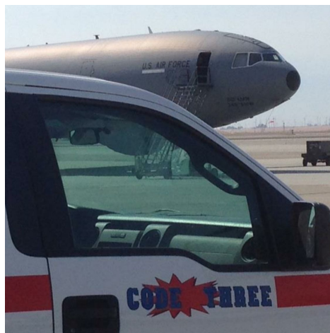
Code Three Fire and Safety units on the flightline, April 2020 Travis Air Force Base, Fairfield, CA

Code Three Fire and Safety is the best source for residential, industrial, and commercial fire protection services in the North Bay and East Bay region. We specialize in fire extinguishers, commercial fire suppression systems, fire sprinkler systems , fire hydrant testing, and hydrostatic testing. We have nearly 25 years of experience and a reputation amongst our thousands of satisfied clients for offering reliable, premium-quality fire protection services at fair and competitive prices.